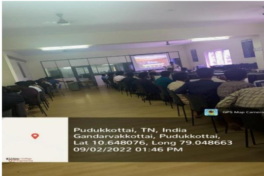
Explanation part in session