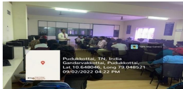
Discussion of Resource Person with participants